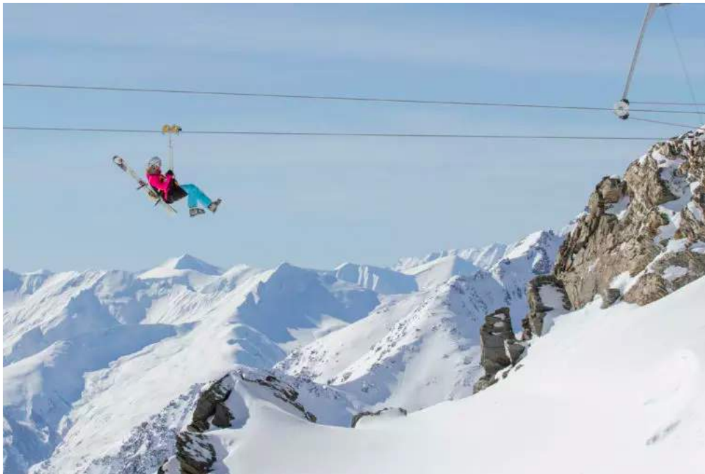
The Tyrolienne - the world's highest zip wire